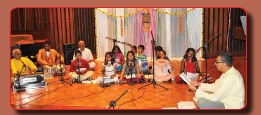
Learners rendering Bhajans at the Bhakti Sangeet Programme on Lotus FM celebrating Youth Day (15 June 2014)